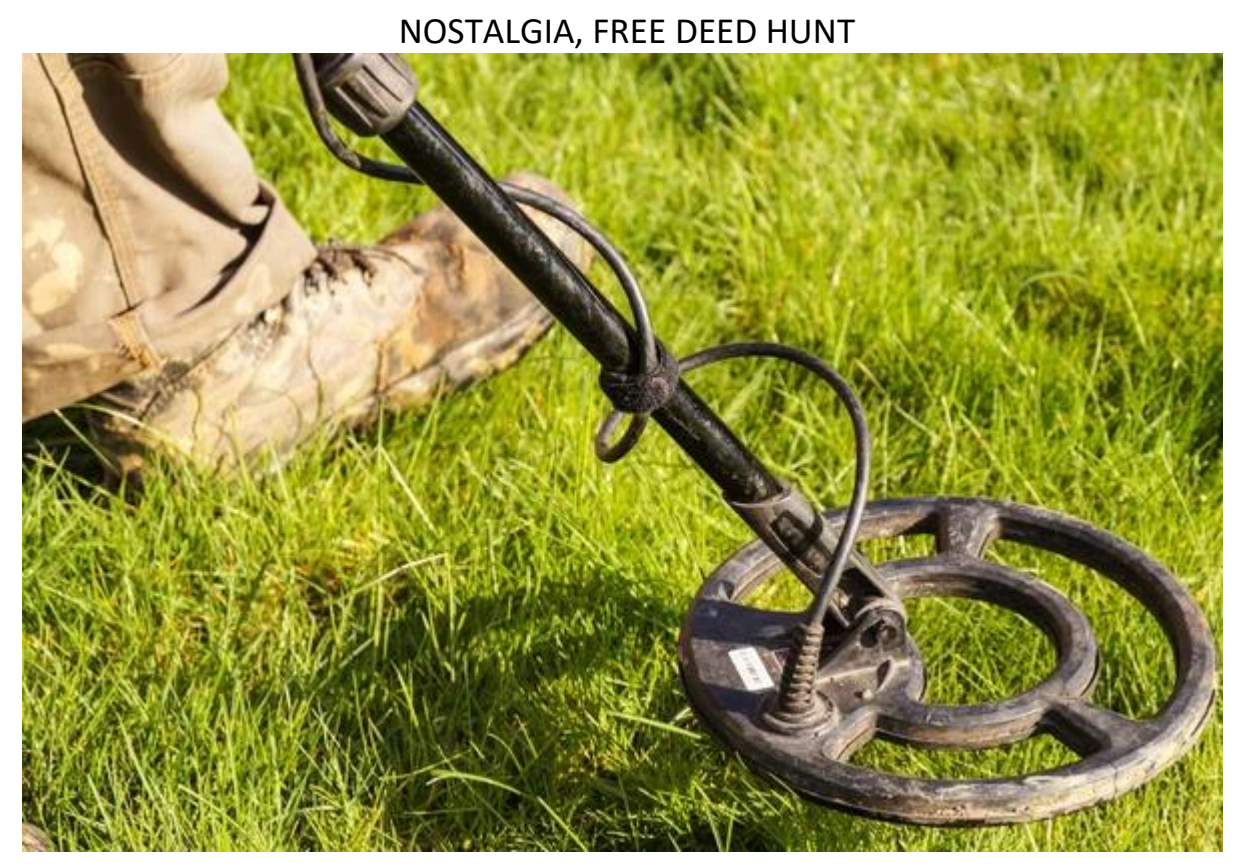
This is a free hunt for 10 lucky winners. If you win a token you will get a Deed to a plot filled with tokens and prizes. There will be 3 Deed Tokens planted in the main 3 hunts on Sunday, July 13<sup>th</sup>. AND you can try for a chance to win the remaining Deed Token.